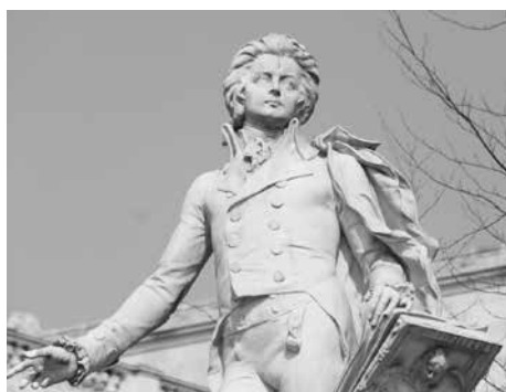
The statue of Mozart in the Burggarten in central Vienna.

In the ten years that followed his arrival in Vienna, until his death in 1791, Mozart composed more masterworks in more genres than any other composer before or since. The tragedy of Mozart's early death is compounded by the fact that during the last years of his life, his music acquired an entirely new level of intensity: polyphonic intensity; developmental intensity; and expressive intensity. And while we cannot know where Mozart's muse might have taken him had he lived a longer life, we do know that