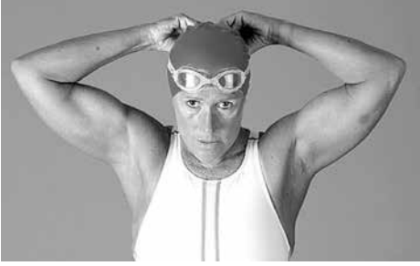
Long-distance swimmer Diana Nyad on Binah, December 10th.