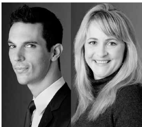
This fall, Ari Shapiro and Kelly McEvers join Robert Siegel and Audie Cornish as co-hosts of All Things Considered.