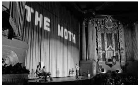
The Moth GrandSLAM at The Castro Theatre.

stories told live onstage, without props or notes — listeners are drawn to the stories, like moths to a flame. (Sunday at 6pm)