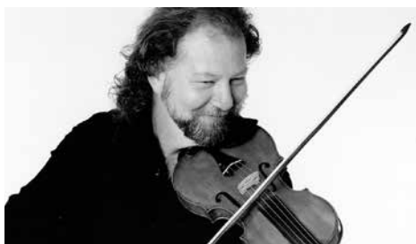
Celebrated Scottish fiddler Alisdair Fraser on Folk Music and Beyond, November 7th.